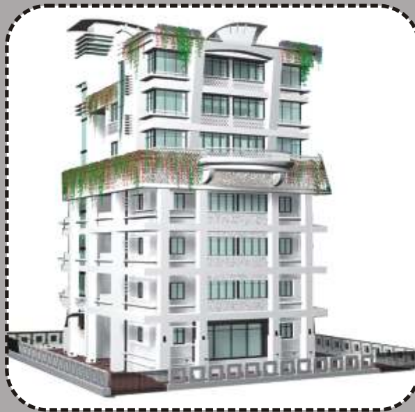
NEELKANT KRIPA at Ghatkopar