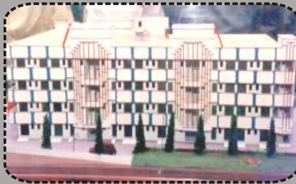
PRABHAT INDUSTRIAL ESTATE at Dahisar