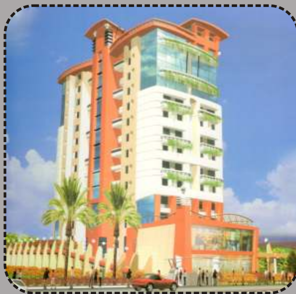
SWASTIK VALUE HEIGHTS at Tilak Nagar