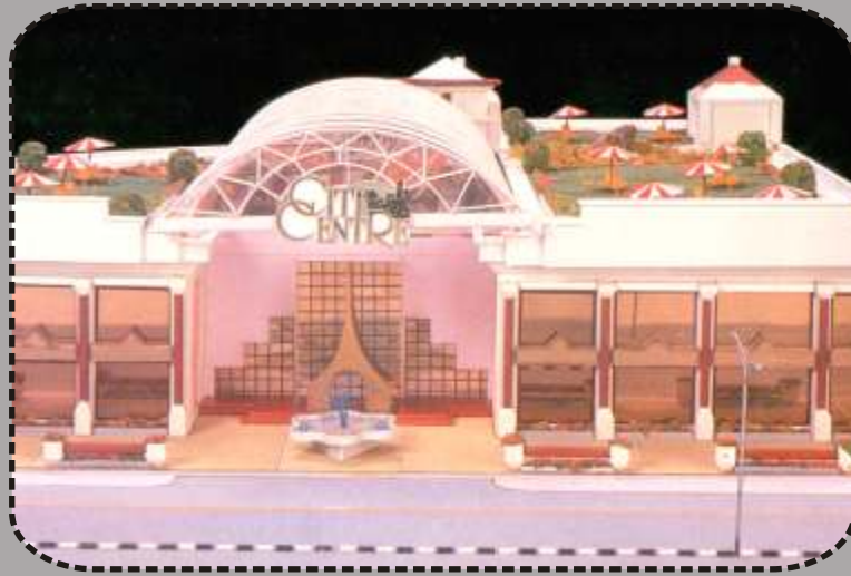
CITI CENTER at Goregoan