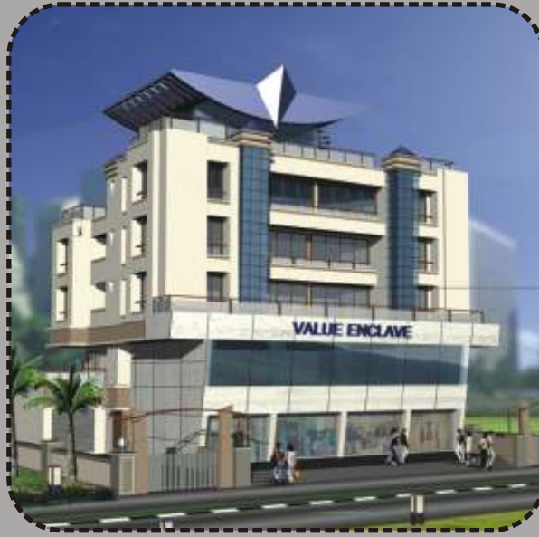
VALUE ENCLAVE at Sion