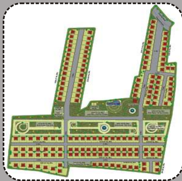
PLOTTING SCHEME at Shahapur